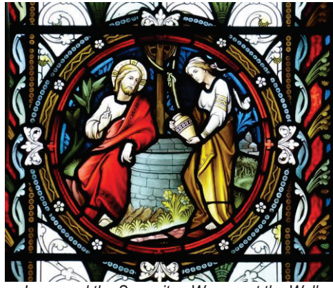
Jesus and the Samaritan Woman at the Well

LENTEN PRAYERS: Stations of the Cross every Friday in Lent – On Friday, March 8th at 7PM, the Stations of the Cross will be led by Thursday Afternoon Bible Study Group.